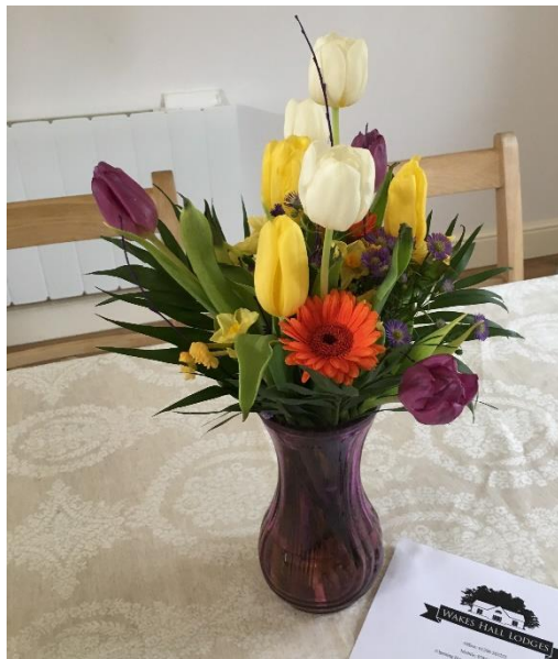
A 'Welcome' of fresh flowers...