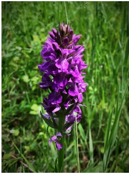
Wild Orchid in the meadows...