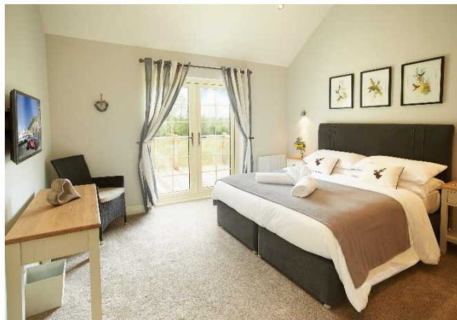
Comfortable beds for a dreamless sleep...