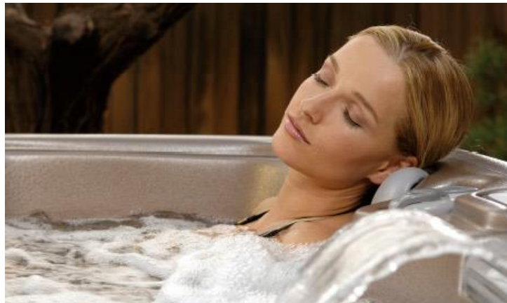
Private hot tubs on the veranda