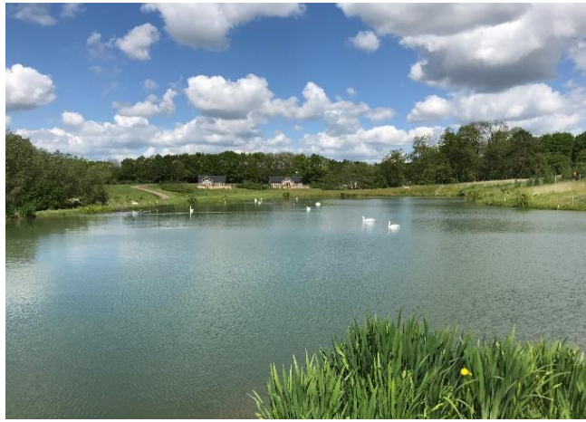
Swans on the Lake...